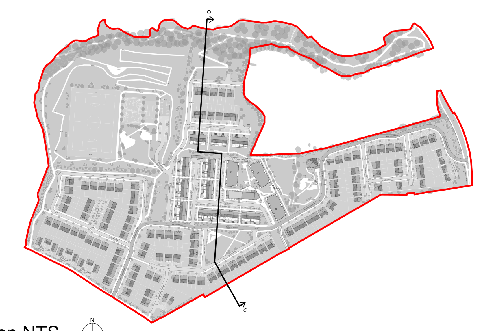
Key Plan NTS