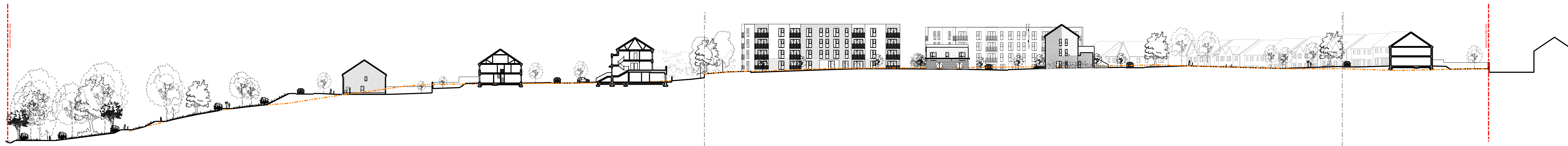
Section CC Scale:1:500